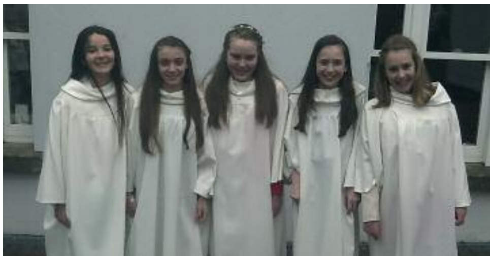
Just some of the girls from St Brigid's School who celebrated the Sacrament of Confirmation on Friday 8th March. The boys celebrated their Confirmation on March 15th by which time this edition of Contact had gone to print.

artistic image!), who resolve to live within the ethos of tradition and apply themselves spiritually to their art, all Christian artists, monastic or not, may indeed write authentic icons.