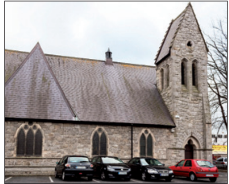
Church of Ireland, Kill o'the Grange