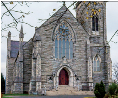
Presbyterian Church, York Road, Dún Laoghaire