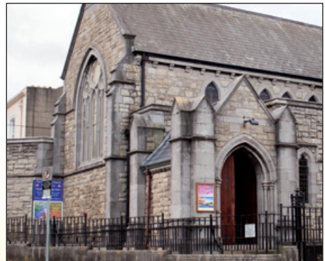
Methodist Church, Northumberland Road, Dún Laoghaire