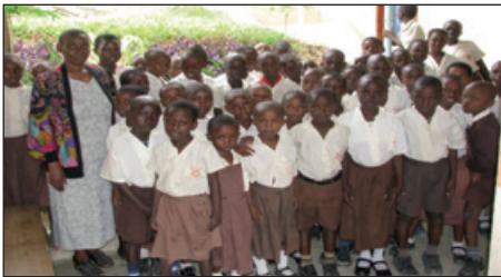
Pupils in Mombasa say "thank you" for their new school