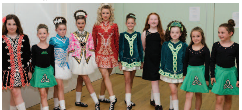
The White School of Irish Dance.