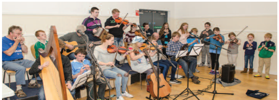
Musicians from Trad Fest Concert held in the Parish Centre on 1st October.