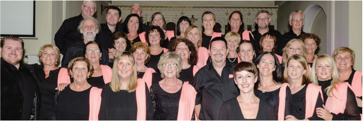
Cabinteely Gospel Choir get into the Summer Groove