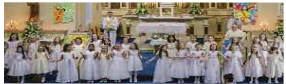
Girls communion mass at 10am on Sunday.