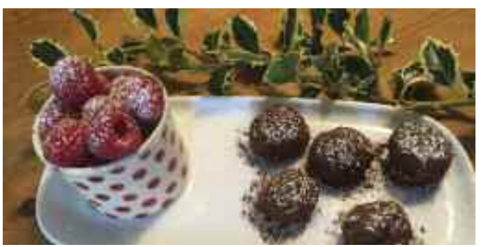
Makes 24-28 truffles - a delicious homemade gift.