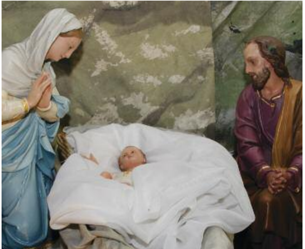
Crib at St. Brigid's Parish Church