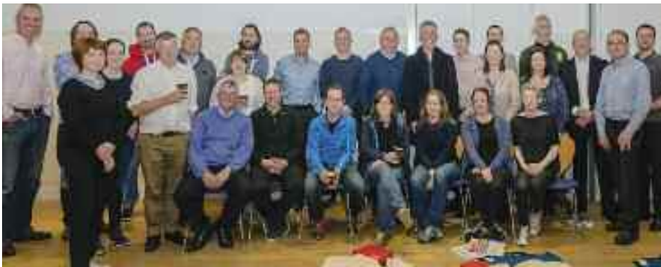
Geraldines P. Moran GAA Club's First Aid Training Course in the Parish Centre.