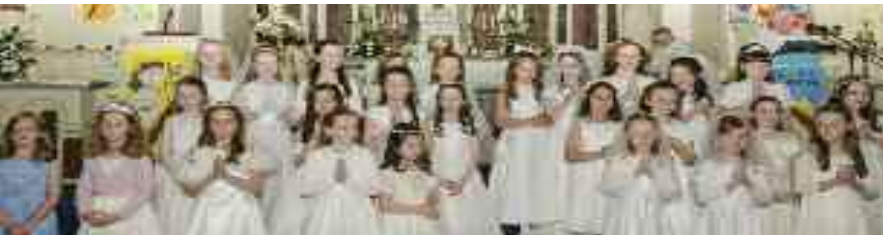
Girls communion mass at 12noon on Saturday .