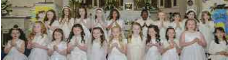
Girls communion mass at 10am on Saturday.