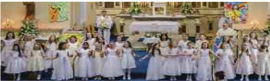
Girls communion mass at 10am on Sunday.