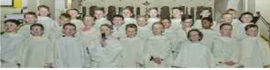
Boys 10am Communion mass.