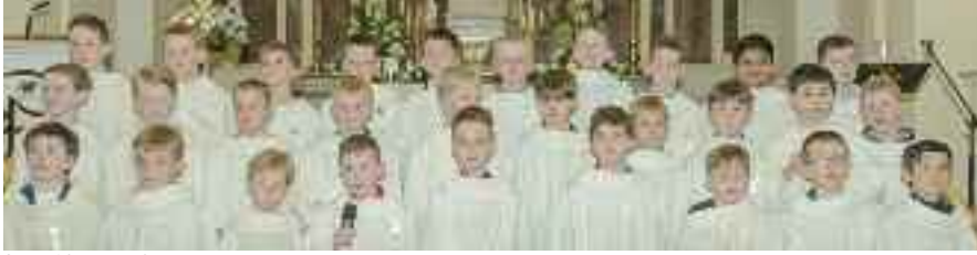
Boys 12 noon Communion mass.