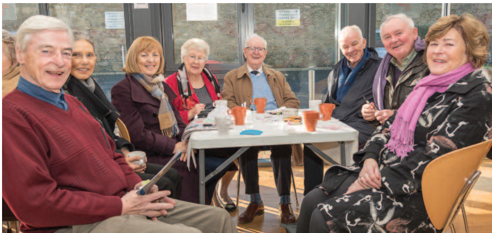
Parishioners thinking outside the chocolate box for St. Valentine's Day