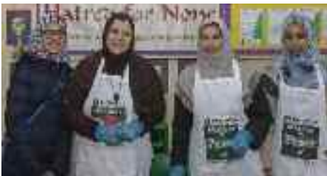
Ahmadiyya Muslim Association.